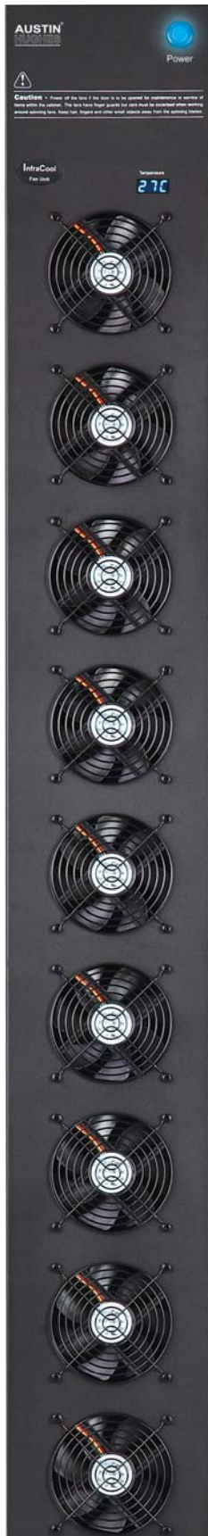
Front Door Cool Air In

Within today's high heat loads inside server racks, it is critical to use a cost effective solution providing cooling as an integral part of the rack equipment. InfraCool F-33.9 Door Mount Fan Panel is that exactly you are looking for.