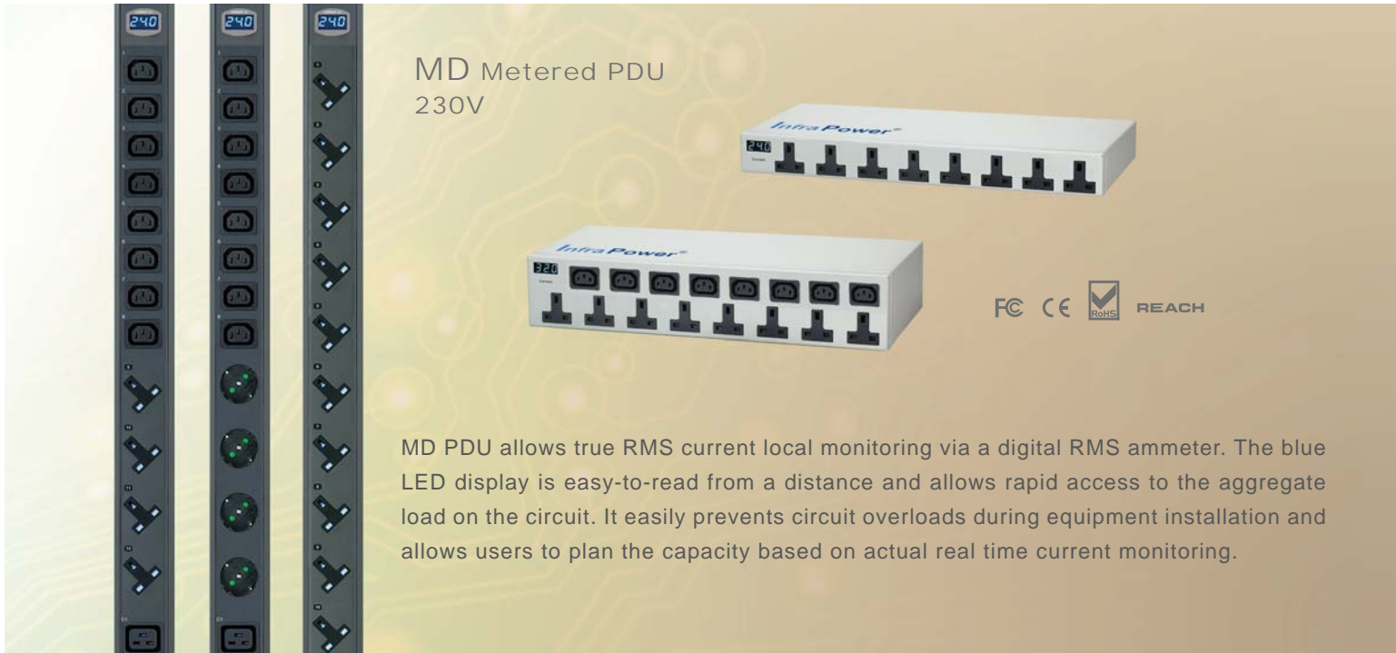
MD Metered PDU 230V

MD PDU allows true RMS current local monitoring via a digital RMS ammeter. The blue LED display is easy-to-read from a distance and allows rapid access to the aggregate load on the circuit. It easily prevents circuit overloads during equipment installation and allows users to plan the capacity based on actual real time current monitoring.